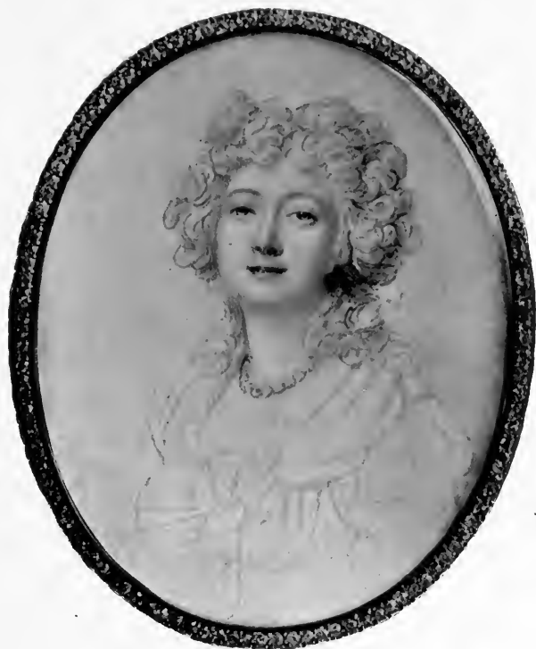
MADAME DU BARRY (1746-1793) BY RICHARD COSWAY. R.A.